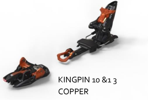
KINGPIN 10 & 13 COPPER

Hazard: The Pin in the toe part can break under rare circumstances. This can lead to reduced release/retention and can result in a fall hazard.