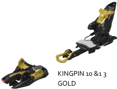
KINGPIN 10 & 13 GOLD